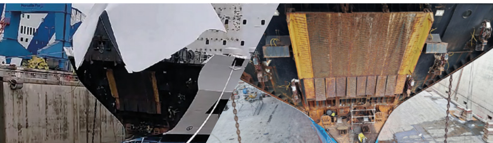
Bow visor repair including electrical and hydraulic parts retrofit. Location: Marseilles, France.