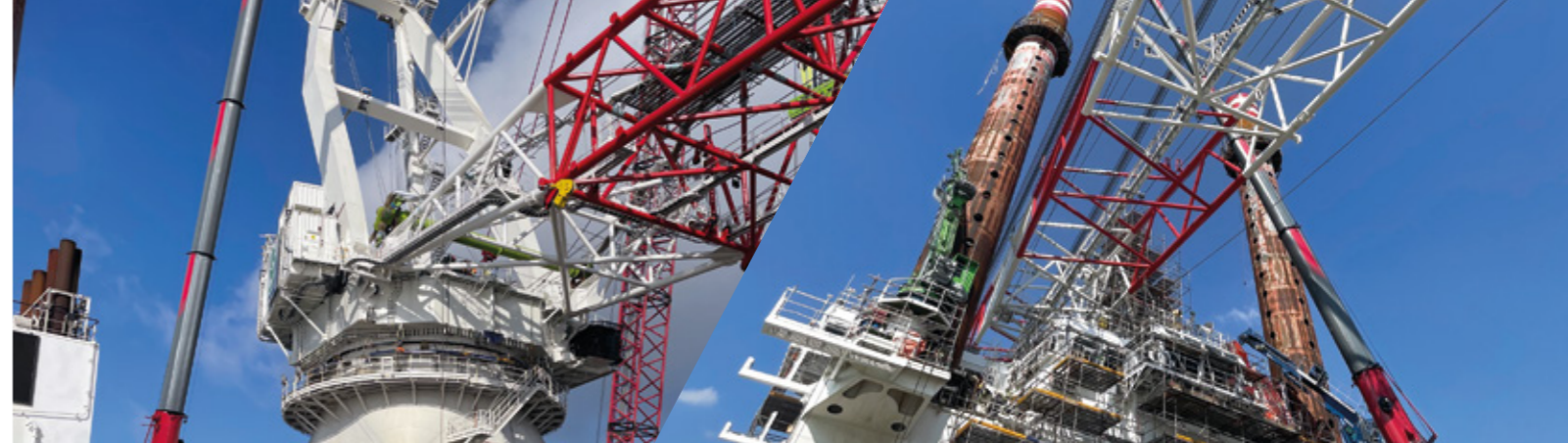
Crane installation, steelworks, GRE pipes - BWTS installation. Location: Rotterdam, Netherlands.