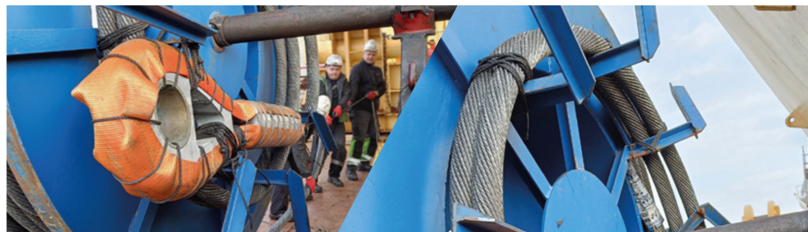
400 tons crane sheaves & \varnothing 72 mm cable replacement, BWTS installation and sheaves restoration. Location: Klaipeda, Lithuania.