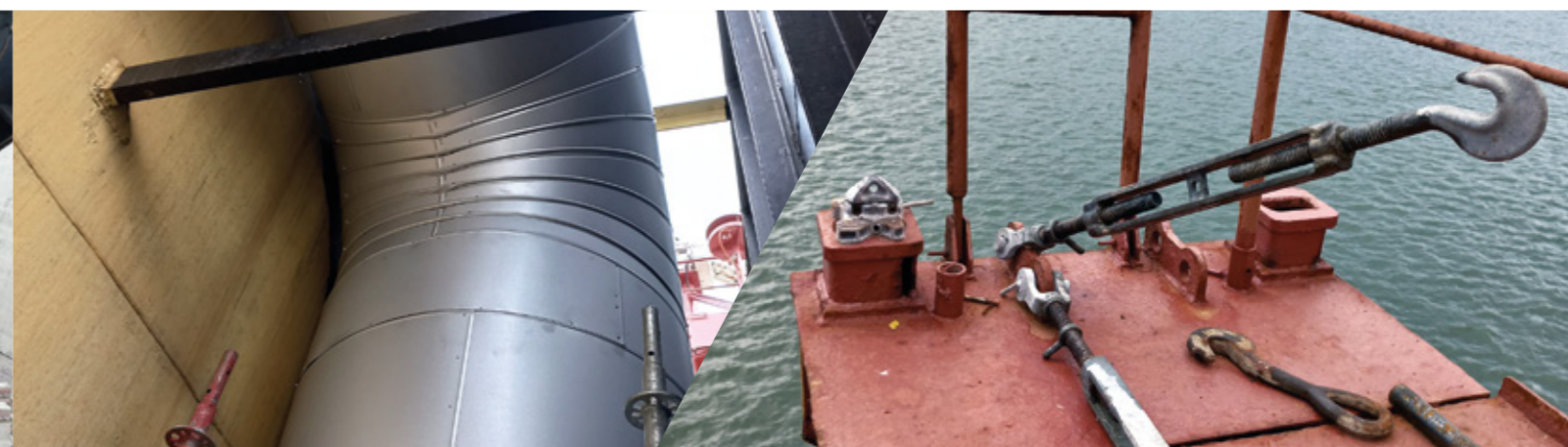
Complex repairs including steel repairs, scrubber system repairs, monorail repairs, and others. Location: Klaipeda, Lithuania.