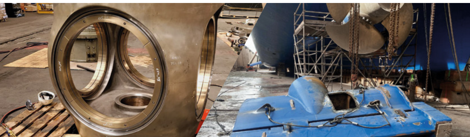
Repairs in Dry Dock – Rudder, steering gear, hub and Promas. Location: Marseilles, France.