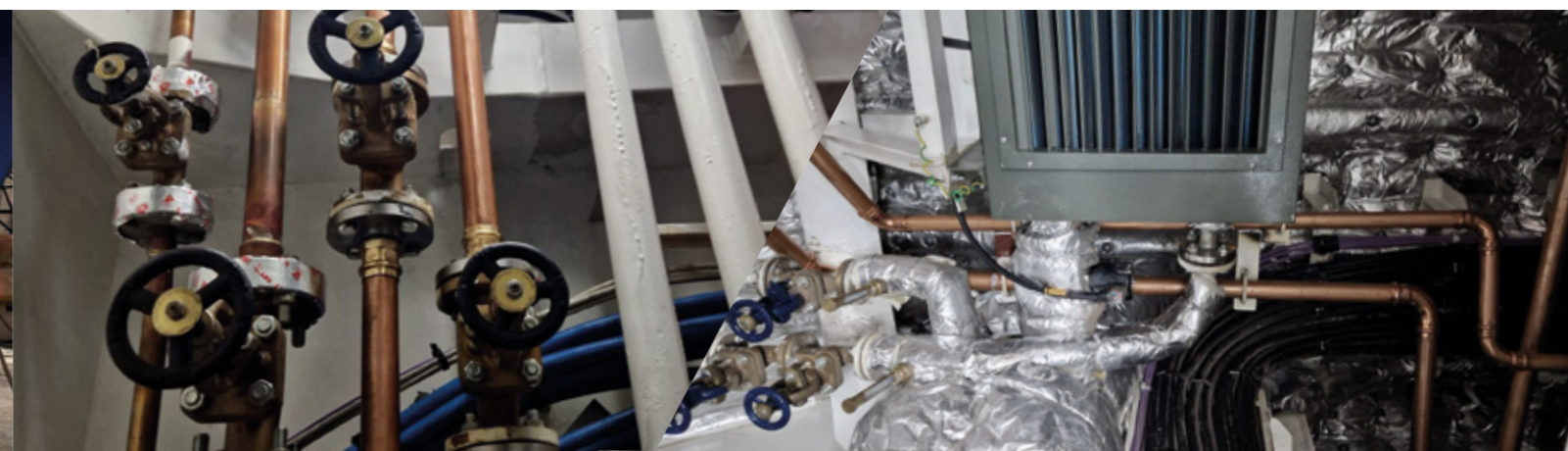
Replacement of 150 m hot water pipe system on LNG carrier. Location: Klaipeda, Lithuania.